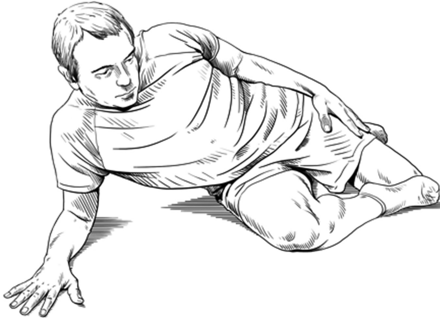
Figure 2 Start position showing relaxing.