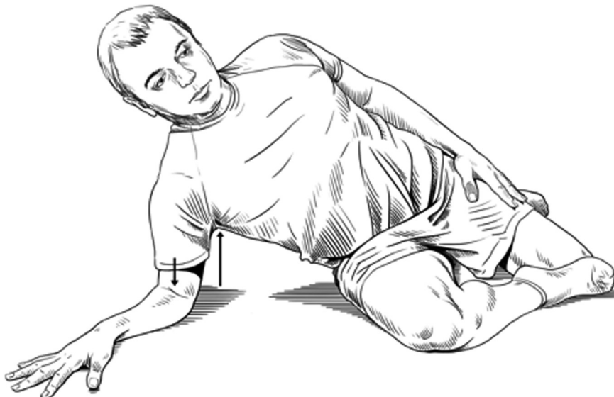
Figure 3 Taking aim – shoulder packing and trunk alignment.