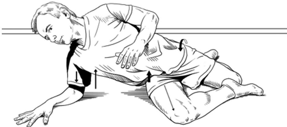
Figure 4 Loading the knee and lifting the hip.