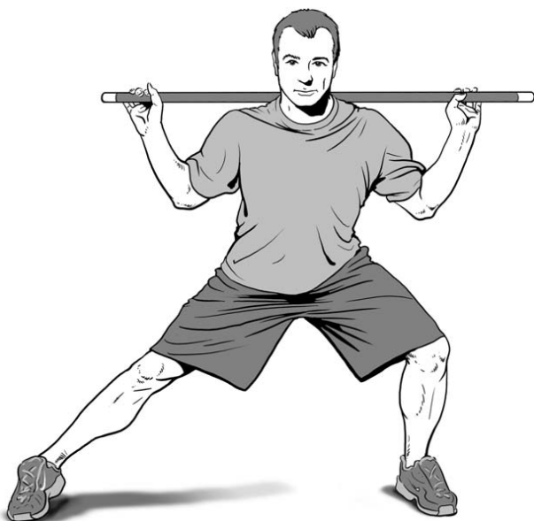
Figure 2 Lateral squat.