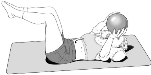
Figure 2 Dying bug with twist.